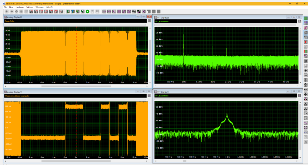
Figure 1: A 1 GHz phase modulated radar pulse (upper left) with the demodulated phase information (lower left). The frequency spectrum of the pulse (upper right) and a horizontally expanded view of the spectrum (lower right)

One such RF application is radar analysis. Figure 1 shows an example of acquiring a 1 GHz, phase modulated radar pulse.