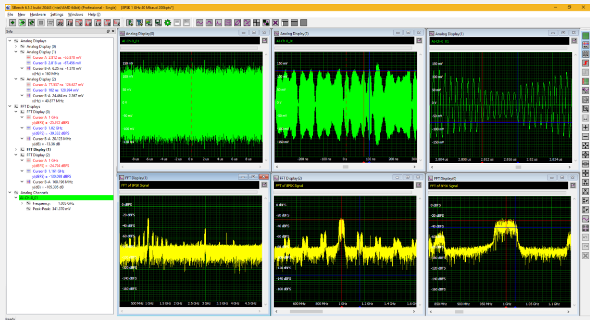
Figure 2: The time and spectral analysis of a 1 GHz carrier quadrature modulated by an 8PSK signal. The upper left trace is the acquired 8PSK signal. Traces to the right are horizontal zooms of that trace. The low left trace shows the spectrum of the signal with expanded views of it to the right.

Communications measurements are another application area where the M5i.33xx-x16 series digitizers can be employed. Most communications systems use a variety of quadrature modulation schemes to efficiently encode data. Figure 2 illustrates an analysis of an 8PSK modulated 1 GHz carrier.